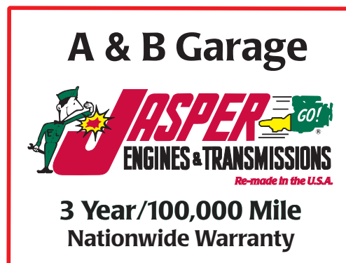
Option #2 - with name, or any lettering that you wish-- such as, "We Install" or "Available Here" or a phone number