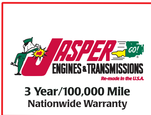
Option #1 - without name

A JASPER Installer Sign is available to independent garages and new car dealerships. The signs are 3' x 4' and are silk screened and embossed on white aluminum with the Jasper Engines & Transmissions logo in four colors. Below the logo are the words "3 Year/100,000 Mile" on one line and on the next line, "Nationwide Warranty." The signs are available with or without individual customer identification. Your identification will consist of your name in vinyl lettering on one line at the top. Only one line of type at the top is available. The vinyl lettering is applied by JASPER. All signs are printed on one side only, are shipped directly to you from JASPER, and take approximately two weeks for delivery.