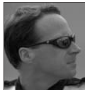
Dave Blaney will drive the #77 Ford Taurus for the 2002 NWC season.

Blaney replaces Robert Pressley, who finished the 2001 season 25th in the driver's point standings. The JASPER Motorsports team finished 23rd in the owner's points.