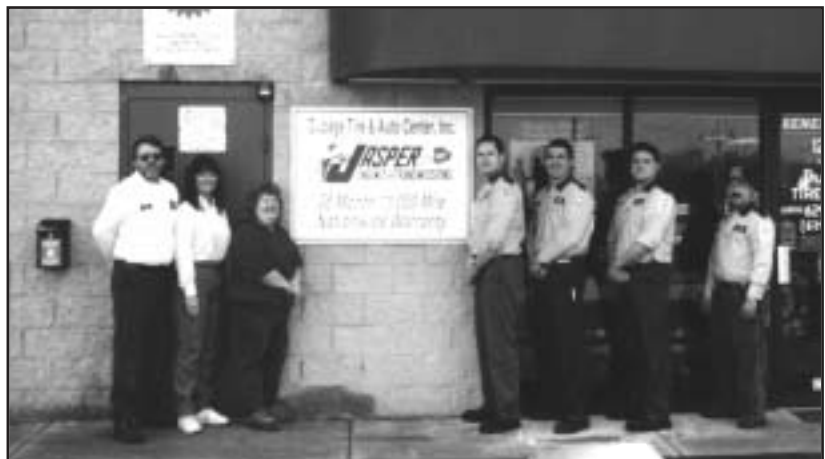
DuPage Tire & Auto Center of Lombard, Illinois, provides full-service mechanical and auto repair to the residents of Chicago's western suburbs.