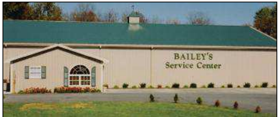
Bailey's Service Center in Shelbyville, Kentucky, offers 12 service bays and 17,000 square feet of work space. They have been cherished JASPER customers for 28 years.

To put it bluntly, Bailey's Service Center knows how to do things right! Congratulations on your success!