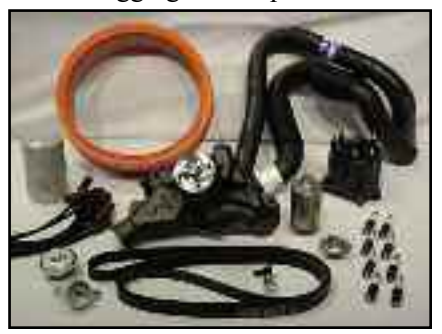
You may find a gift card inside your next JASPER custom packaged parts

From time to time, JASPER likes to add special "prizes" to the parts kits. It's like digging for the prize at the