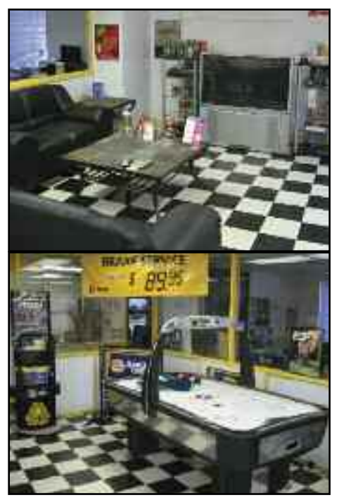
With a 60" TV, Xbox and an air hockey table, the customer lounge is geared to a younger generation.

When it comes to using JASPER remanufactured products, Extreme Automotive has purchased them from day one. "It's the quality of the product," says Bobby. "When I install it in a vehicle, it's my name on the line."