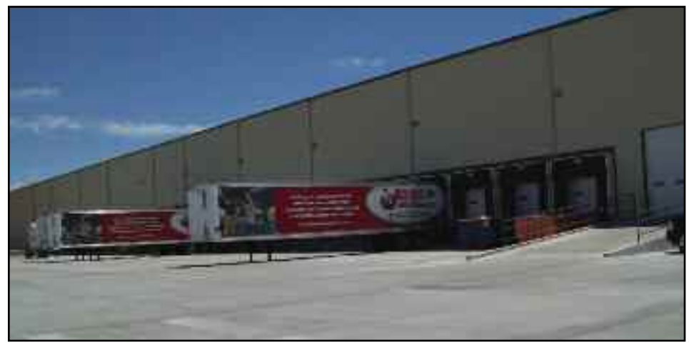
The Kingman distribution center currently uses half of the 69,000 square feet of available storage space. The rest is reserved for future use.

Jasper Engines & Transmissions has opened a distribution center in Kingman, Arizona, to better serve our branches and our customers.