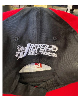
The above shirts and hats with the JASPER logo all qualify for 50% co-op reimbursement, provided funds are available.