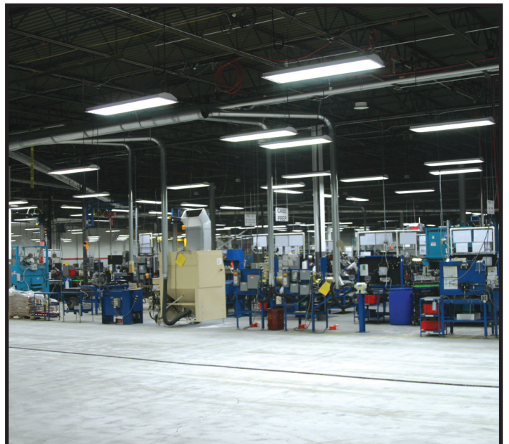
Several Jasper Eco-Tech LED lighting systems illuminate the production areas of the Power Drive remanufacturing facility.

“It’s amazing lighting,” added Schroeder. “Production Associates have been impressed by it. The brightness of the LED lights has reduced the need to install task lighting in specific work areas, which means Power Drive uses less lighting than our other remanufacturing areas because the available lighting is more effective.”