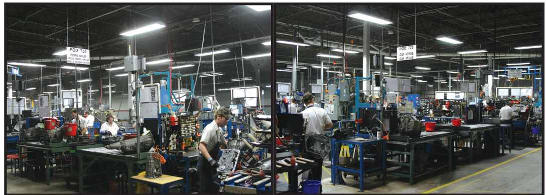
As of press time, seven remanufacturing PODS and over 60 Associates now call Power Drive home.

JASPER's first transmission from the new 220,000 square foot Drivetrain Remanufacturing facility (called Power Drive within the company) was built September 8th, 2014. That's when six Associates built a front-wheel drive GM 4T65E from their newly moved remanufacturing work area, or POD.