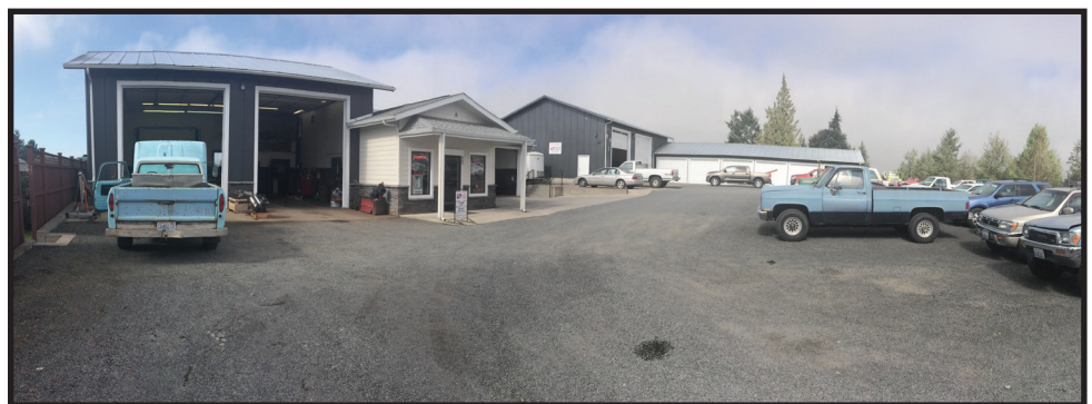
Lewis County Fleet Services in Chehalis, Washington, has been a JASPER installer since 2005.