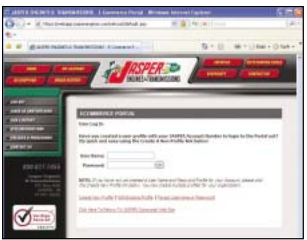
JASPER's Fully Customized E-Commerce Portal allows you online pricing, online ordering, and account information. Create your account today!

If you haven't already, go to www.jasperengines.com and create a user name and password profile for your account to use on the Portal and log on. Access to the Portal will be available through both the 'Installer' and 'Fleet' links on the left toolbar of the site, and the existing 'Find A Price' area of the site for Installers and Fleets.