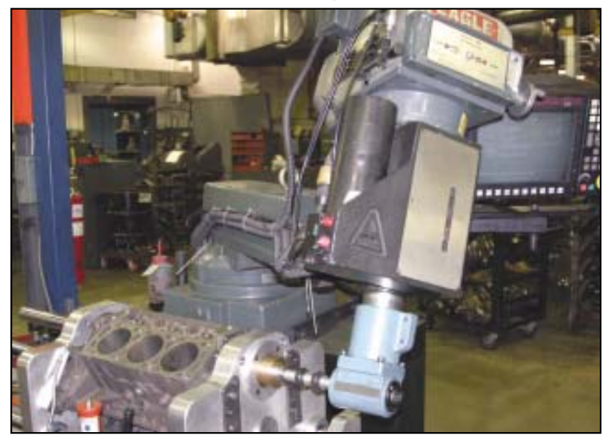
The CNC-controlled align boring machine eliminates cam bore alignment issues on the GM V6 engine before bearings are installed.

of the cam bore are one size, while the outer bores are .010 larger," says Bakke.