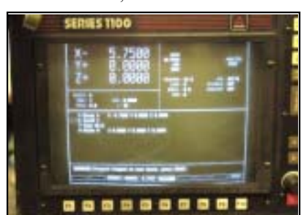
The CNC computer keeps track of the align boring process.

JASPER mounts the block into a CNC-controlled align boring machine with a four-cutter boring bar. "When our work is finished, the two center sections